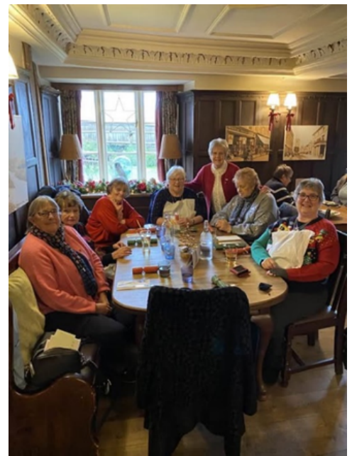
Teignbridge JDs enjoying a lovely Xmas lunch today at the Barn Owl. We had a very happy time.