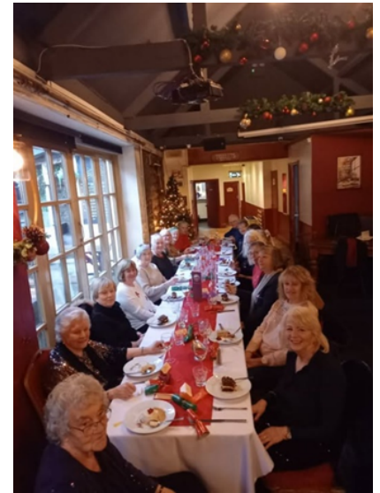
Swansea 2 JD Group enjoying Xmas lunch-chatting, eating and a little drink 😊

Since joining the Jolly Dollies , the widows group, last November, I have done so many social things with them, whether it's the weekly quiz group, going to see a show, or just the coffee morning meet up and they provide the support network one needs when you lose your loved one 🙏 They are the only people who really know what you are going through, as they have experienced it themselves at some stage. I've made so many friends and I really appreciate each and every one of them, they all bring something different to the table and there's always lots to laugh about, we have so much fun all year round, so thank you ladies.