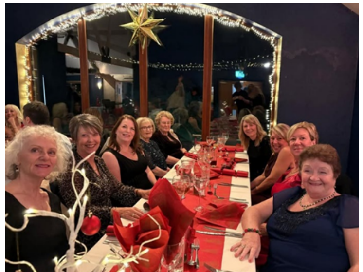
Christmas meal out for South Gloucestershire 1 JDs.