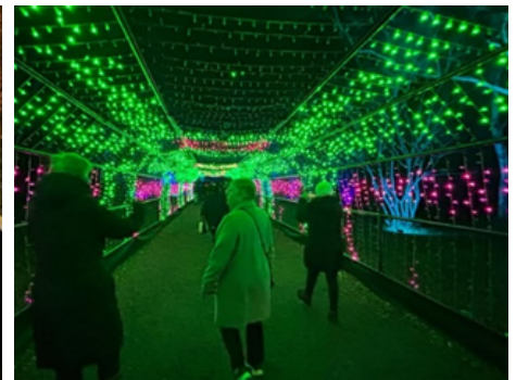
Some of Runnymede JD group at Windsor Illumination.