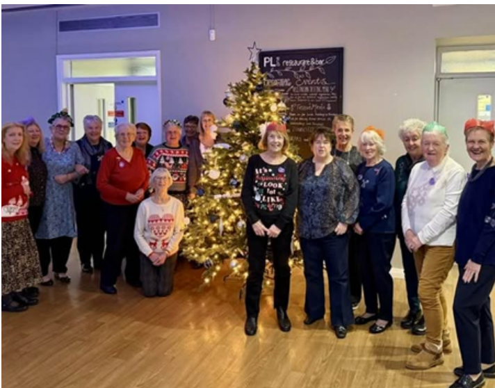
Wishing you all a Very Happy Christmas from our lovely Plymouth JD group 🎄🍷🥳

Since joining the Jolly Dollies , the widows group, last November, I have done so many social things with them, whether it's the weekly quiz group, going to see a show, or just the coffee morning meet up and they provide the support network one needs when you lose your loved one 🙏 They are the only people who really know what you are going through, as they have experienced it themselves at some stage. I've made so many friends and I really appreciate each and every one of them, they all bring something different to the table and there's always lots to laugh about, we have so much fun all year round, so thank you ladies.