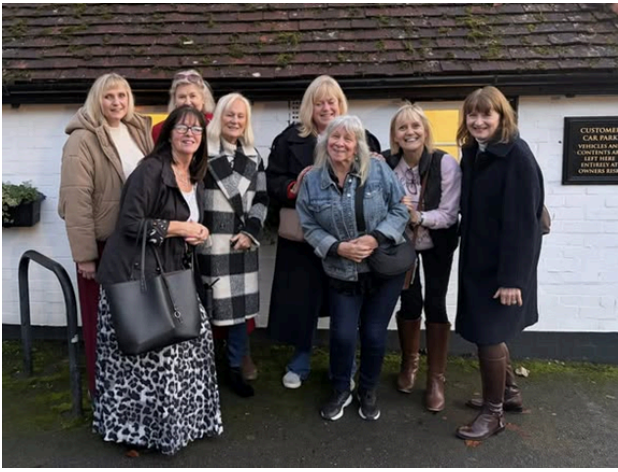
Dorking JD Group Christmas luncheon... too busy chatting we nearly forgot to take photos!