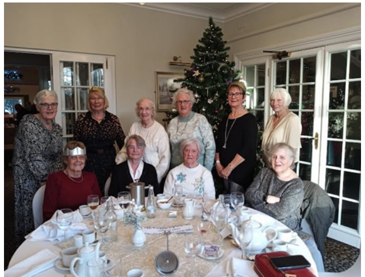
Weston-super-Mare 2 JD group having our annual Christmas lunch at Beachlands hotel on the sea front. Great lunch again (our 11th year)