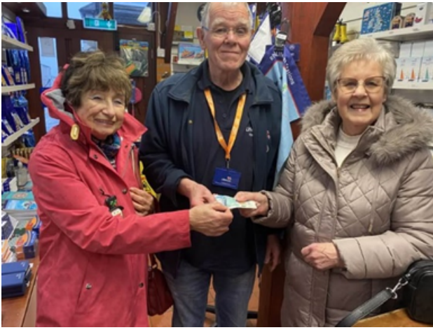
Our Xmas donation to the RNLI was gratefully received. Thankyou Teignbridge JDs.