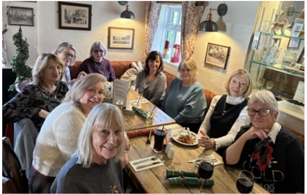
Most of the Cheltenham JD group enjoying Christmas lunch today. 🎄