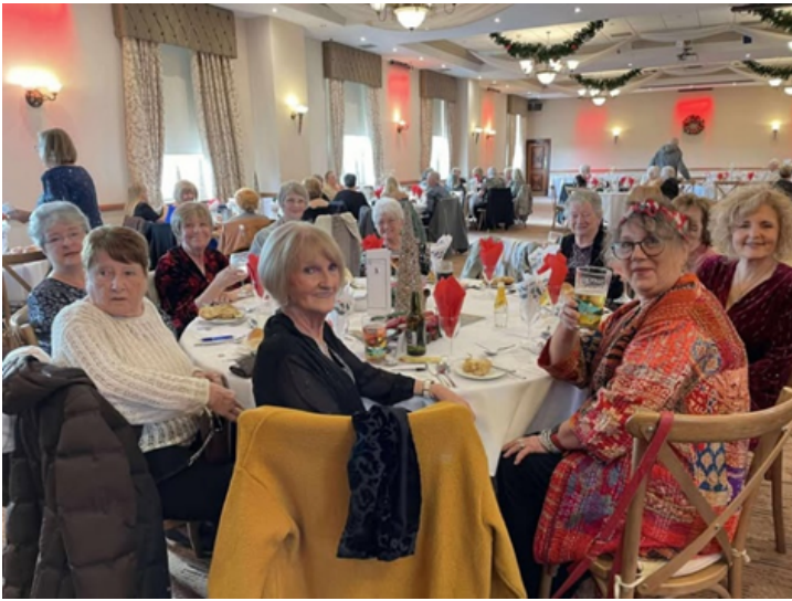
Some from Swansea JD Group enjoying a Christmas party at the Towers Hotel.