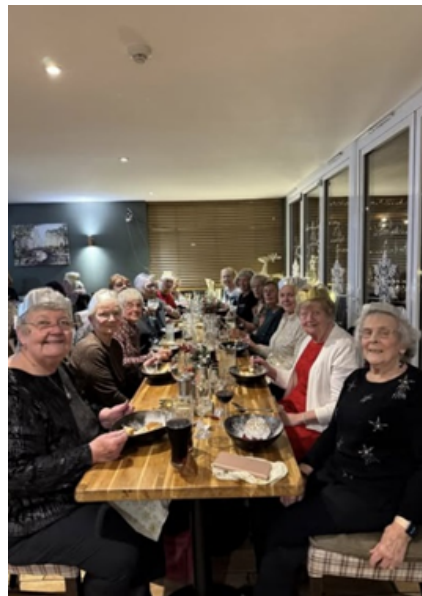
15 Hereford JDs met for Christmas dinner last night at the bay horse a lovely evening and fabulous food as always, one day I will try and remember to get a photo before we mess the tables up! Wishing JDs everywhere a Happy Christmas and a good new year xx