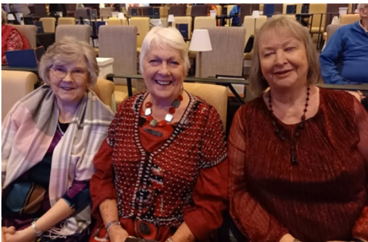
3 Swansea 1 JDs enjoying in Warners Holme Lacy xmas meal and pantomime.