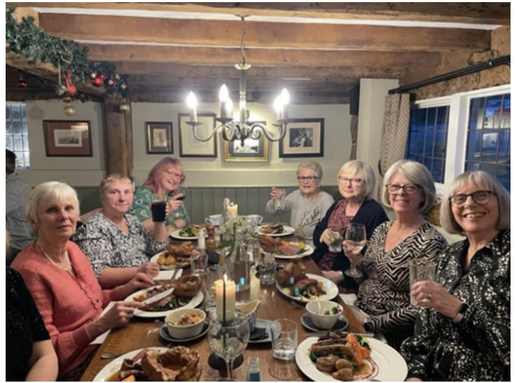
The Horsham JD group had a lovely Christmas meal at The Bolney Stage.