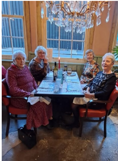
4 ladies from the Gloucester JD group enjoying a Christmas lunch today.