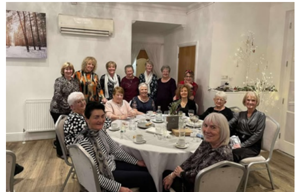
Some Swansea JD group after enjoying a lovely Christmas lunch at the Norton Hotel Mumbles