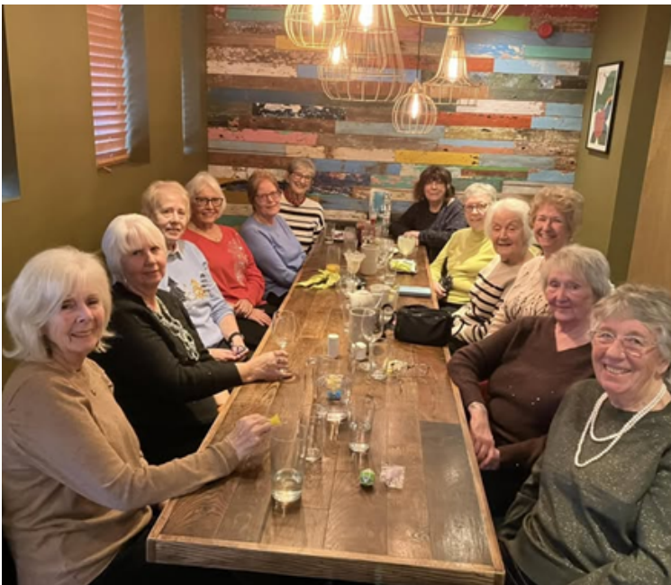
Runnymede JDs Christmas lunch, a lot of chatter so nearly forgot to take a photo.