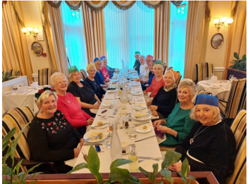
Barnstaple JD group 1 out for our Christmas lunch.