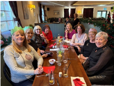
Exeter JD group - Eight of our members managed to get together for a lovely Xmas meal and Xmas sheet quiz games afterwards - being there for each other really helps.