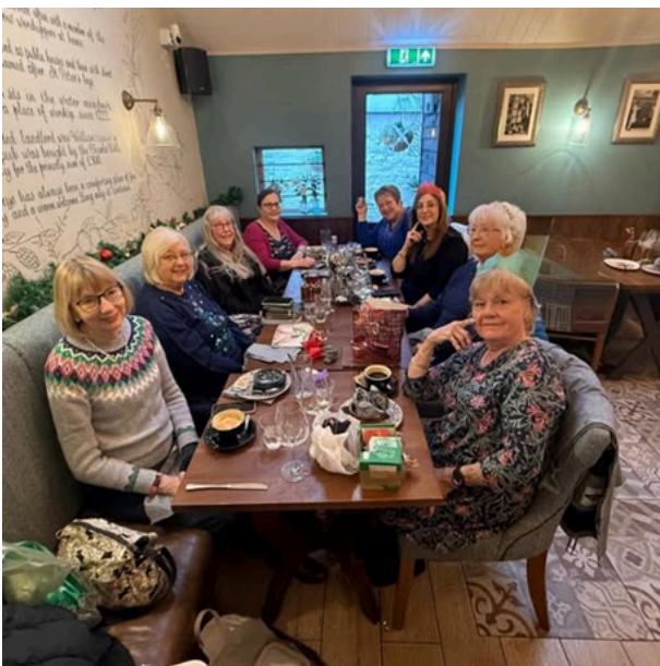
Eight Milton Keynes JDs enjoying Christmas lunch at the Cross Keys in Woolstone.