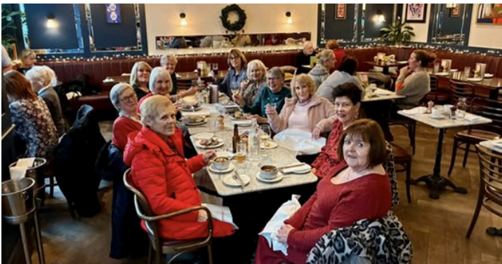
Bristol Westbury on Trym JDs had a great time today. Cocktails in Harvey Nicks and a Christmas lunch in Cote Brasserie. Great company, good food and lovely staff.