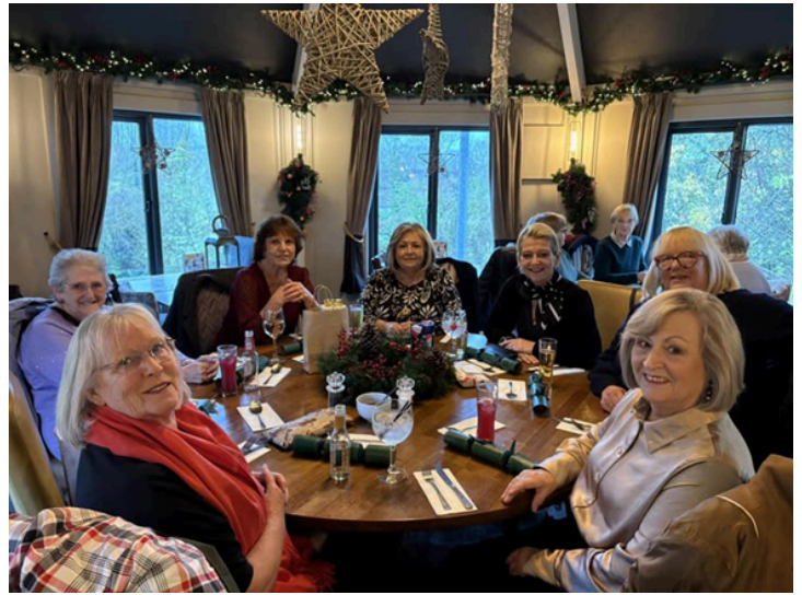
Christmas meal with Cambridge Jolly Dollies, ❤️