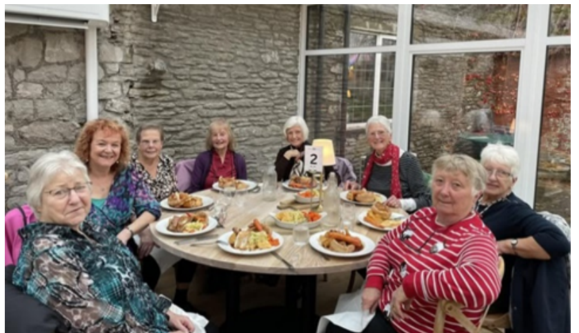
Weston-s-Mare 1 JDs having our Christmas meal at Mendip Spring Golf Club today.