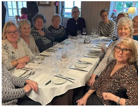
Windsor JD group Christmas lunch a lovely time had by all.