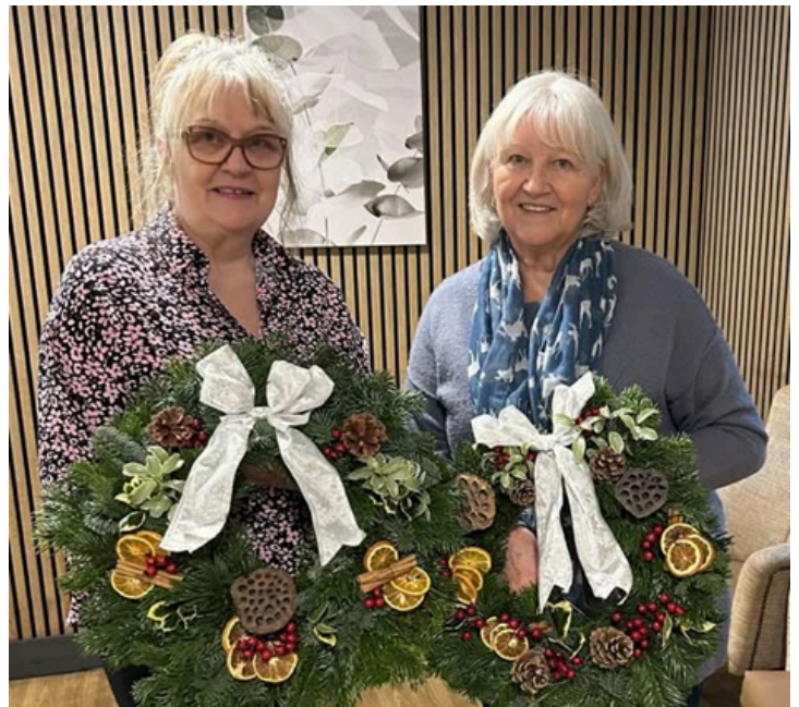
A couple of members of the Farnborough JD 2 group went to a wreath making masterclass this afternoon. Not sure how long it will stay in one piece!!