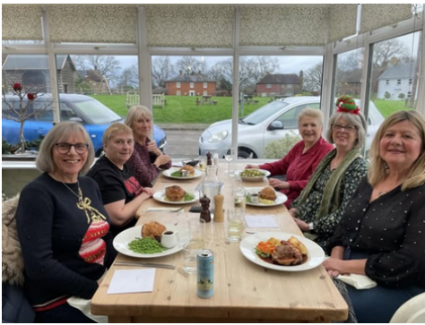
A lovely lunch today with some of the Ladies of the Horsham JD group at The Crown at Dial Post. Fun times with good company 🎄