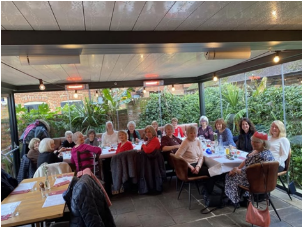
Wokingham 2 JDs enjoyed an excellent Christmas lunch at The Lord Raglan pub today.