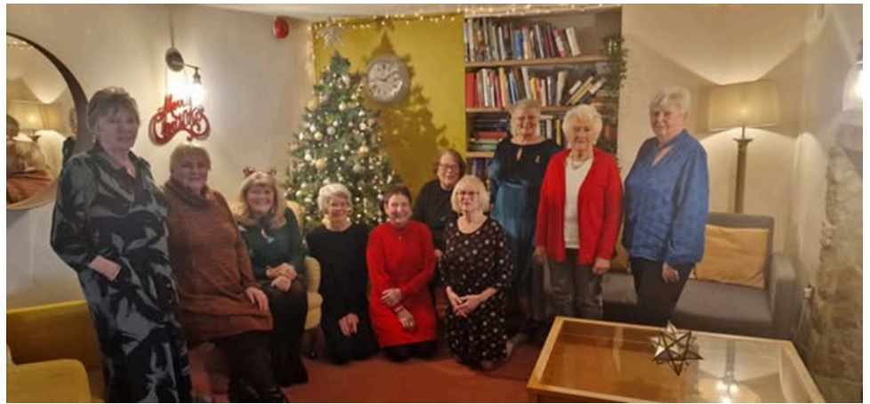
10 of Chard's JD's enjoyed a lovely Christmas lunch together at The Lordleaze Hotel, Chard. Great company and a lovely meal. Xx