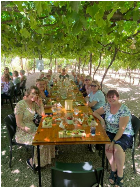
Lunch – What a beautiful shady location