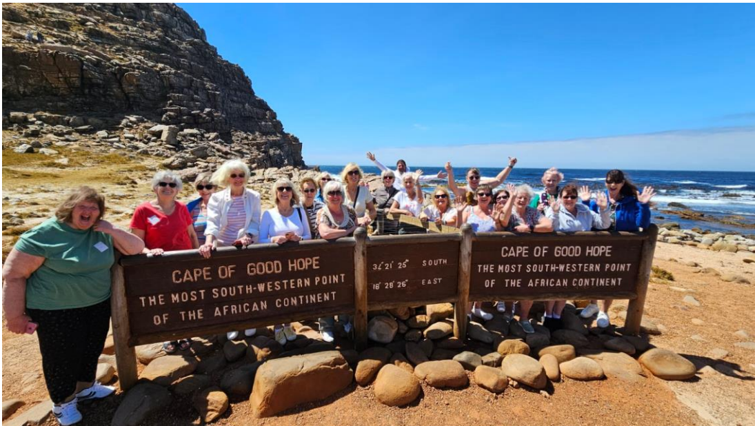
Cape of good hope