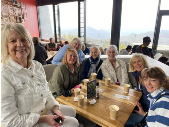
Pre Flight meet up