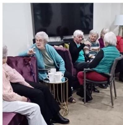
Great LocksHeath/Fareham Group 1 coffee morning with a table groaning with all the raffle prizes.