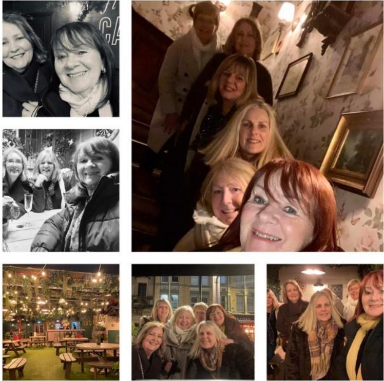
Great day / night out with the Cardiff Group 1 JDs. Lovely food and company as usual ladies. X