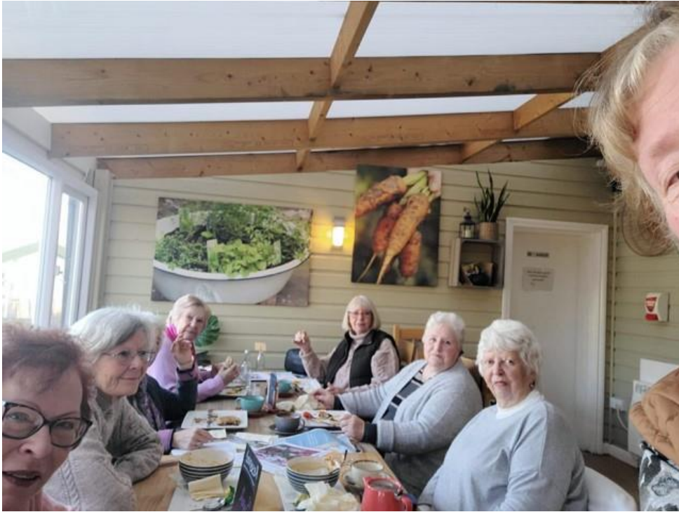
8 of the Chard group of JD's out for lunch today at Brimsmore Garden Centre restaurant in Yeovil.