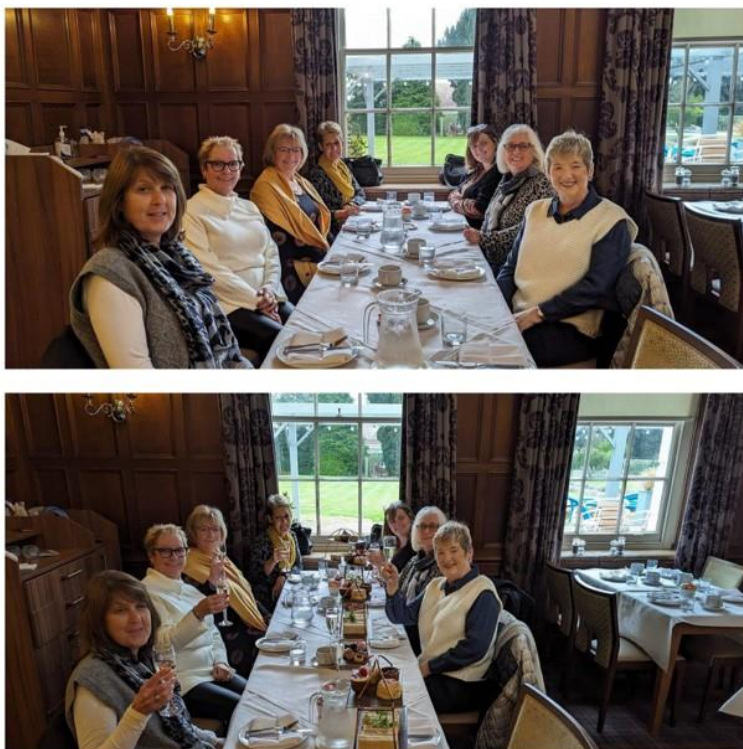
Worthing 2 JD get together for a Sunday afternoon tea lots of chatter and laughter had by all .missed those that could not make it xx