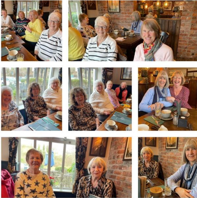
The Torbay 1 Jolly Dollies , out and about today. Teas, coffees and lunch (for some) at The Wighton in Torquay. Lovely to meet up- as always! ❤️