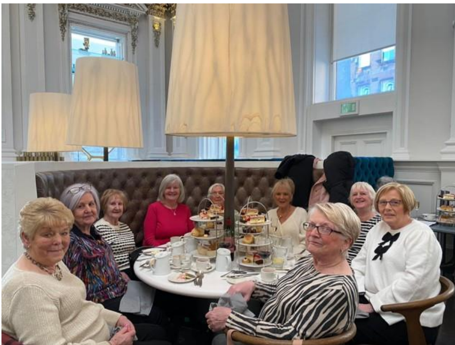
Another lovely afternoon tea at the Corinthian with the Glasgow JD's

A very happy and prosperous New Year, may your friendships grow stronger