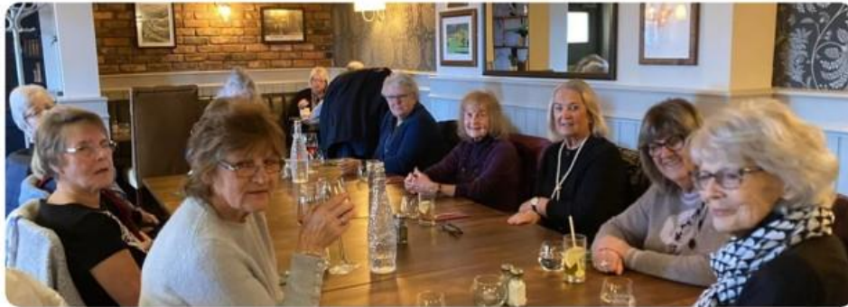
Weston group 1 – Enjoying a lovely January day together