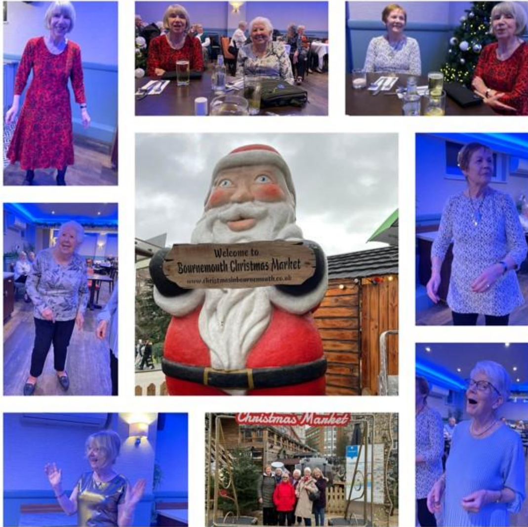
Torbay Jolly Dollies. Six of us JDs having a jolly time. ❤️

I wrote this on New Year's Eve 2020, 6 months after losing my husband and 6 months and 6 weeks after losing my dad.