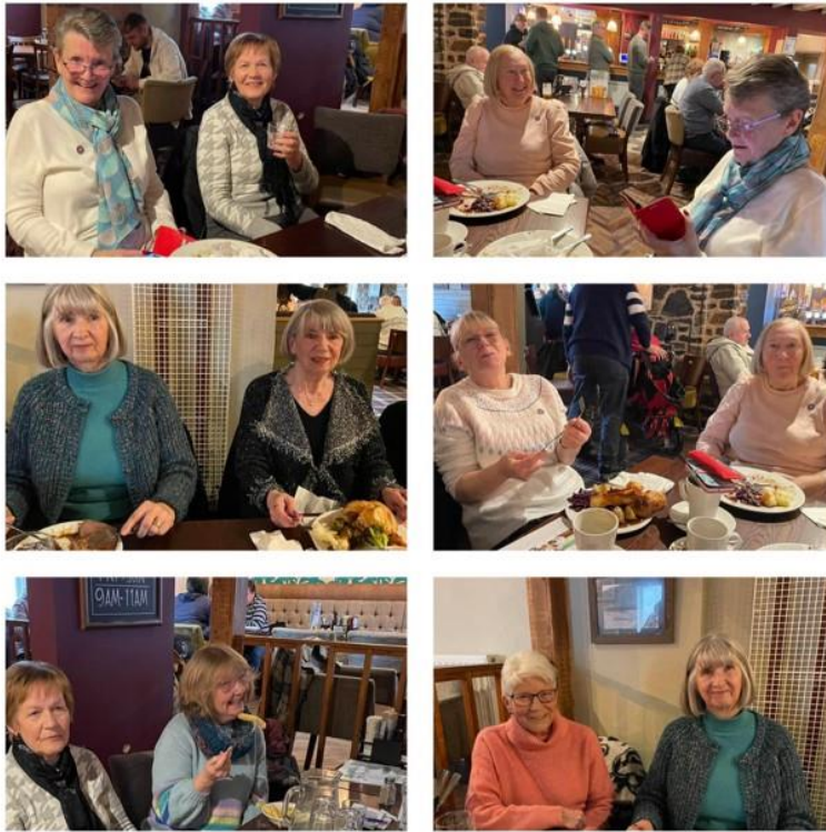
Torbay 1 Jolly Dollies, at The Old Engine House, Torquay. Only eight of us today, but we enjoyed it- as always. ❤️