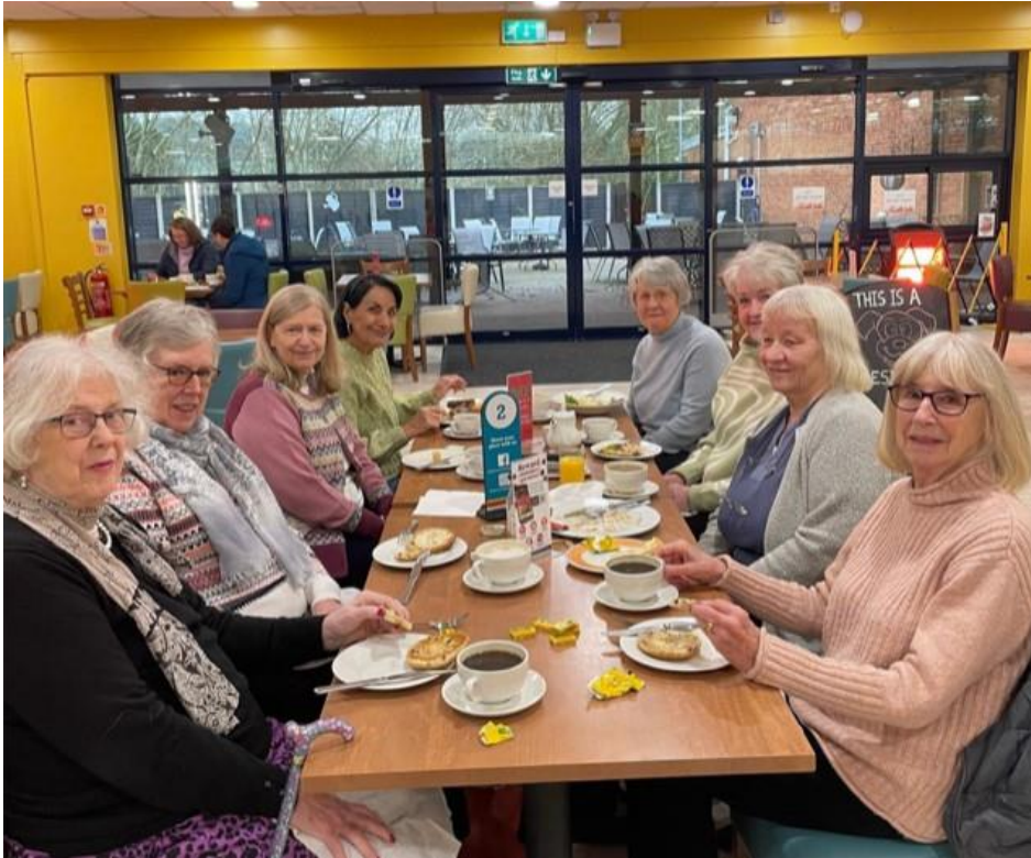
Eight Stourbridge JDs at Barnett Hill Garden Centre. Plenty to eat and drink and lots of chat!