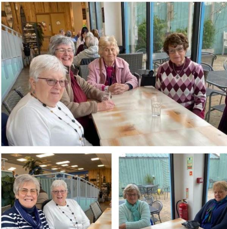
Another happy get together for Teignbridge ladies .