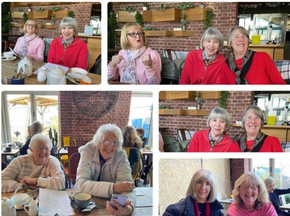
Seven of us (The Torbay Jolly Dollies) met up at China Blue in Totnes this morning. ❤️

Have a wonderful holiday to all of our JDs heading off to South Africa tomorrow... safe journey, enjoy that beautiful country and enjoy each other