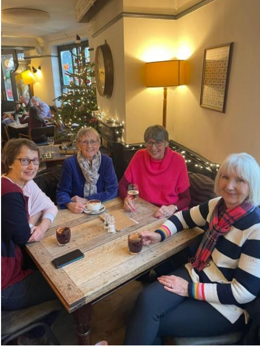
Bristol Westbury on Trym group.

A few of us had a lovely festive drink in a local pub this afternoon! Cheers everyone and hope you all have a Happy and Peaceful Christmas 🎄