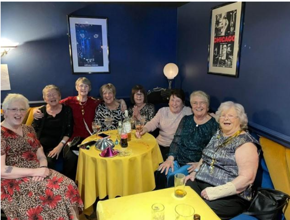
Eight Swansea Group, having a wonderful New Year's Eve in Torquay

A few of us had a lovely festive drink in a local pub this afternoon! Cheers everyone and hope you all have a Happy and Peaceful Christmas 🎄